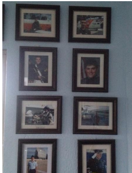
Soar Truckee "Wall of Fame"