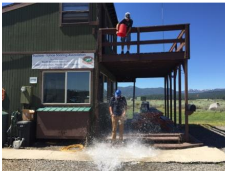
Solo tradition at Truckee