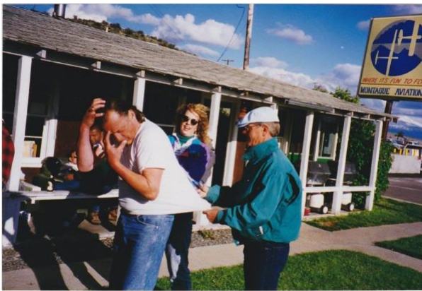
Solo ritual, Montague (circa 1980)